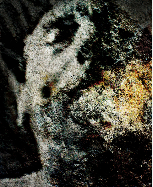
Joseph (2004/09/26/00/15), 2015