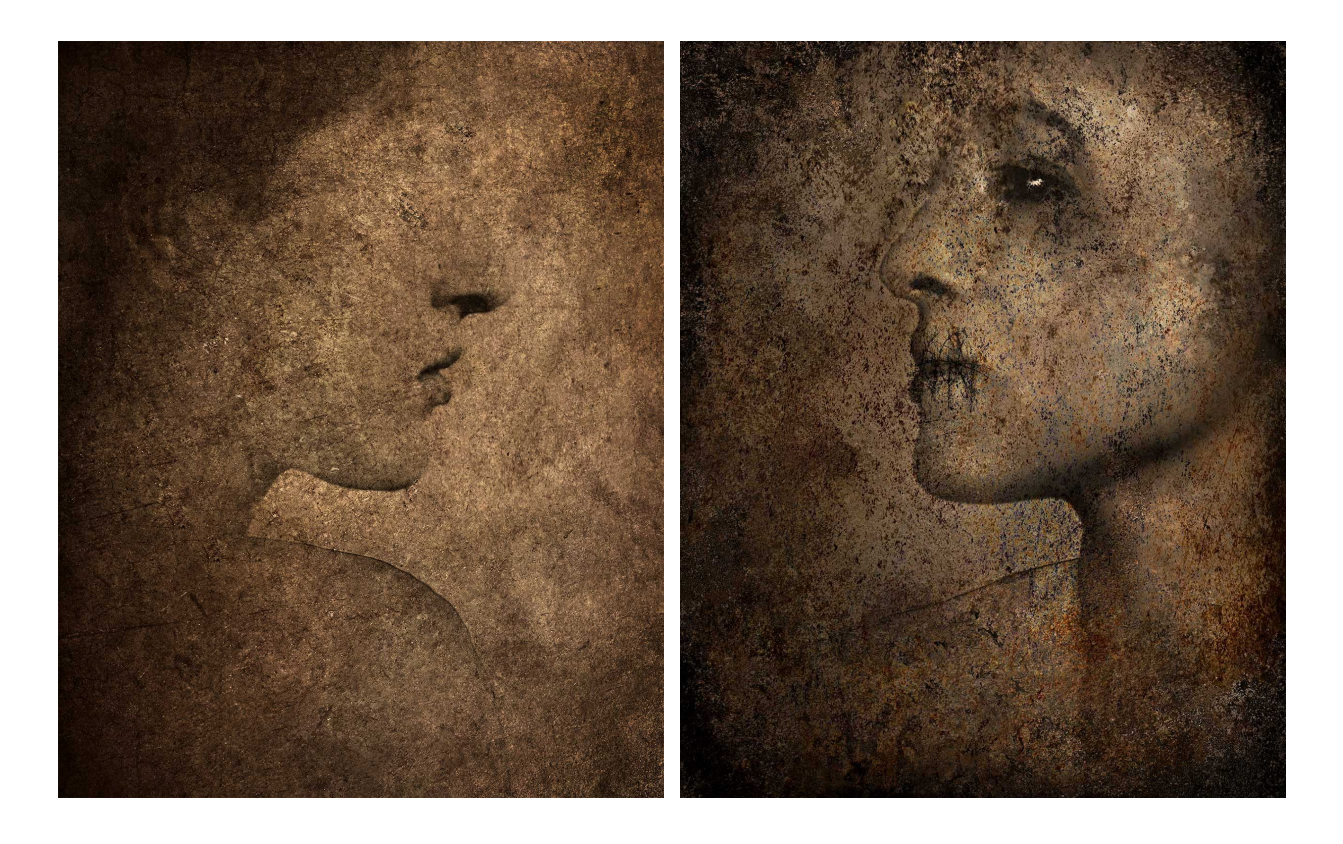
FR (persona, no. 1) and FR (persona, no. 2), 2014