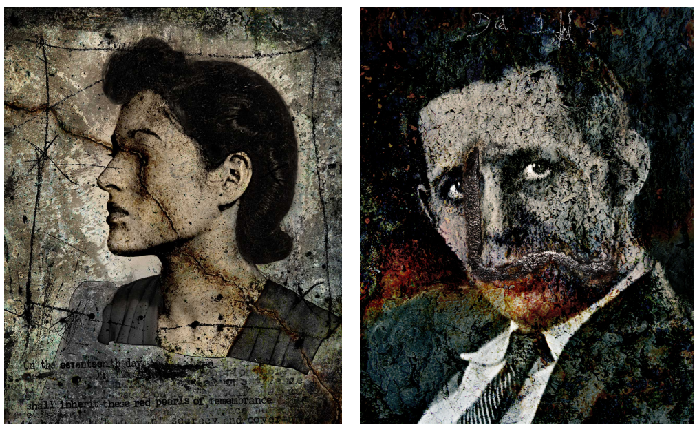
Frances (red pearls), 2012

experience of the sinister and desolate. This strangeness deepens when we observe the series of selfportraits, untitled selves , made by the photographer, which cannot be read without having seen the series of his parents; in untitled selves his features appear blurred, almost erased, where the beginning and the end of the face are confused, disintegrating as if they were grains of sand.