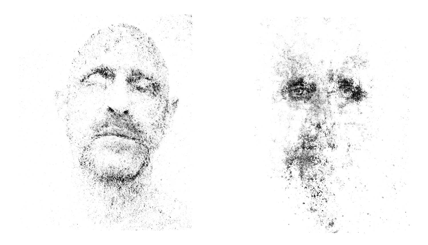
untitled self, no. 79 and untitled self, no. 23, 2017